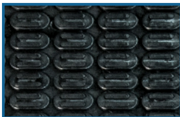
Double button tread